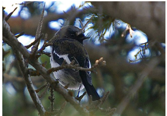
male Blue-capped Redstart , Chitral Gol NP, 26/10