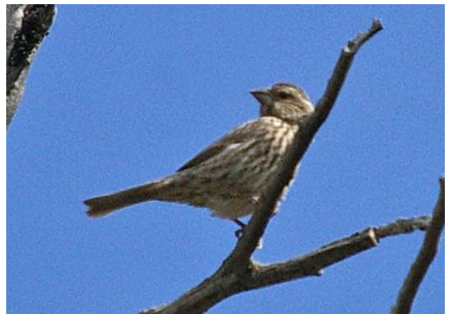
female Blyth's Rosefinch , Chitral Gol NP, 26/10