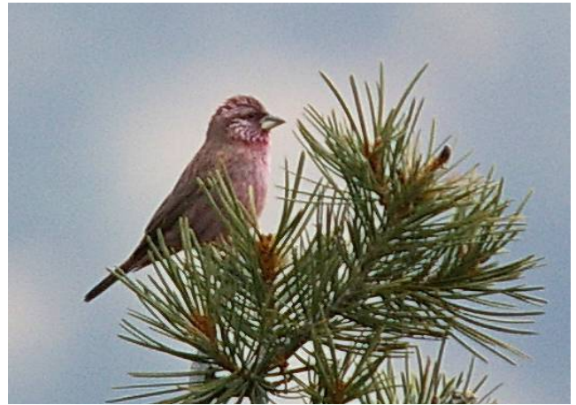
male Blyth's Rosefinch , Chitral Gol NP, 26/10