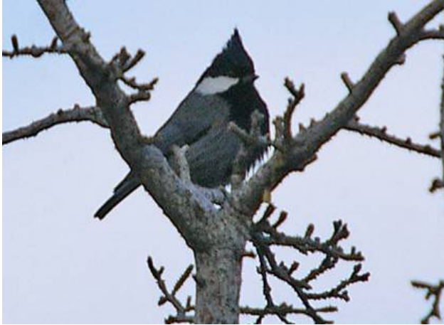
Rufous-naped Tit , Chitral Gol NP, 26/10