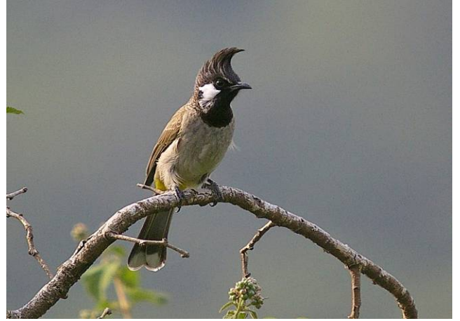
Himalayan Bulbul , Margalla Hills, 3/11